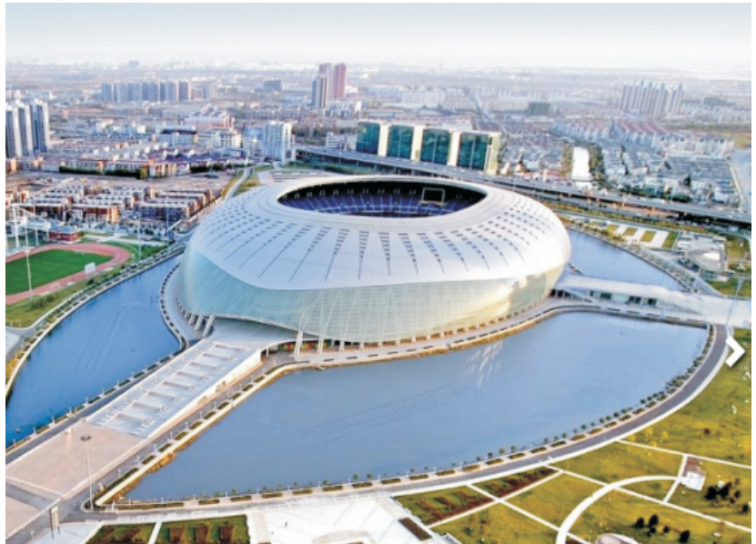
Innovation at it best