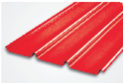
Concealed Fixed Roofing System

These technological advancements make Steel, the perfect choice or a construction material that can be moulded into any desired form, giving the structures the shapes that the architect's desire. In this regards, LYSAGHT as a product offers a wide range of roof and wall cladding profiles with structural products. ♦