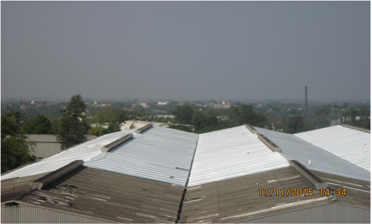
Completed Body Shop