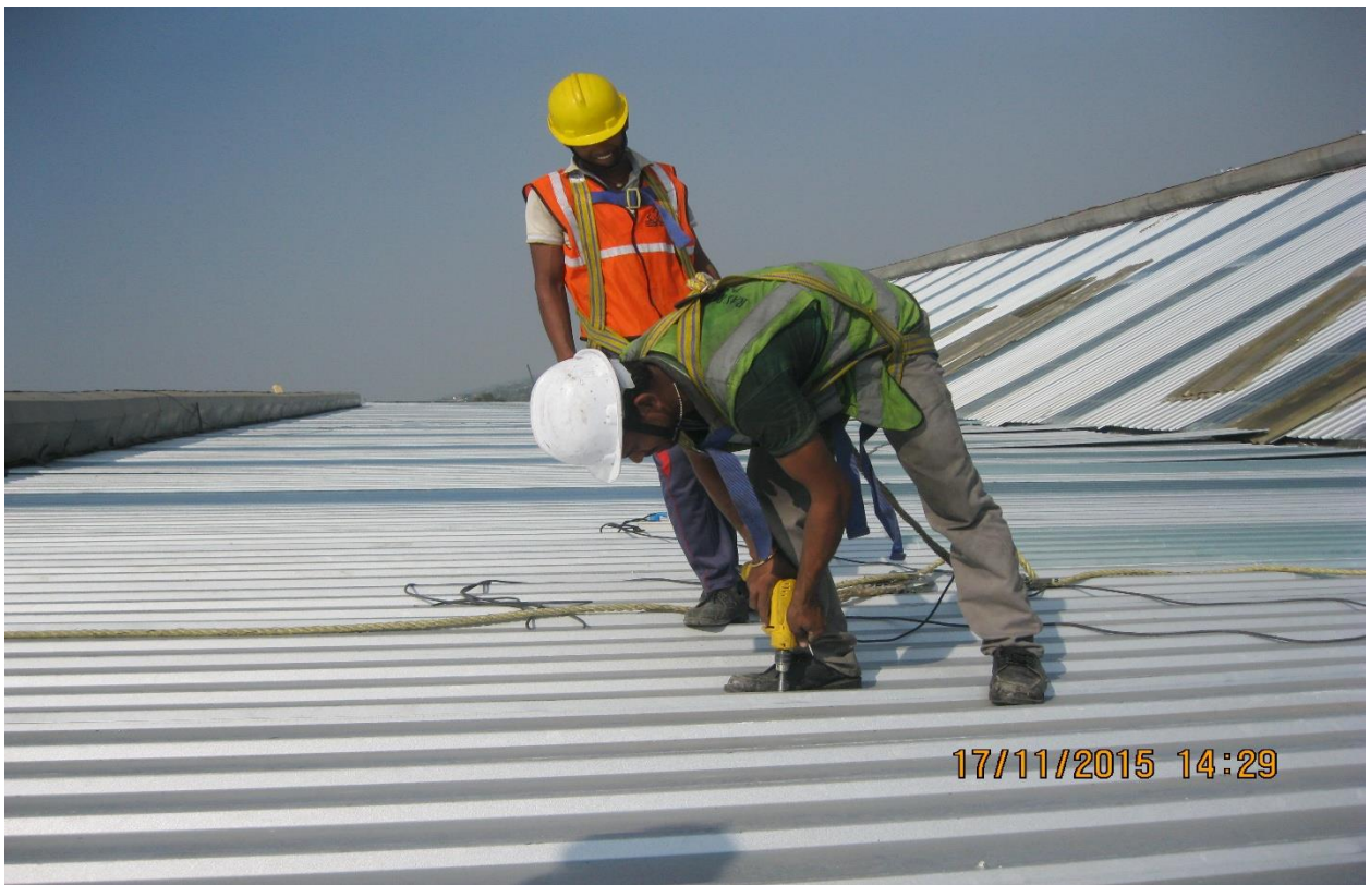
Final Screwing in progress in Press Shop