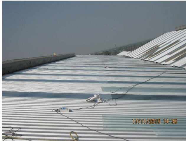
Installation Completed in Press Shop