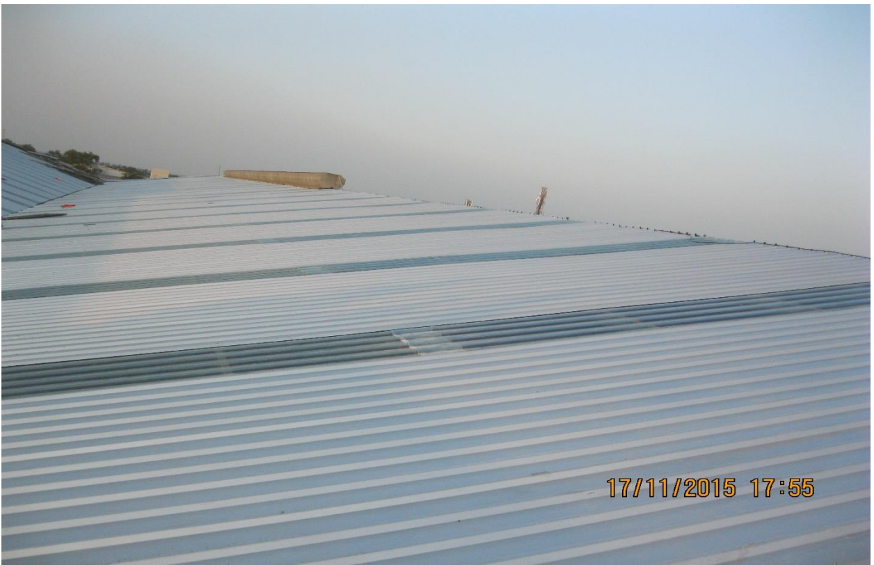
Completed Bay of Assembly Shop