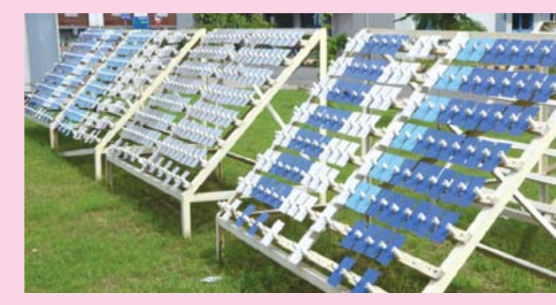
Exposure site : Jamshedpur India (Industrial)

research into paint technology development and real life field performance over a full range of climatic conditions.