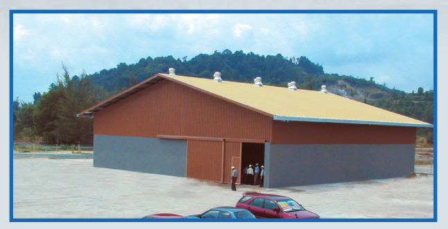
Small Industrial Units