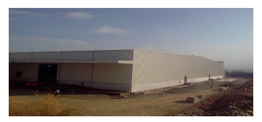
Tata Boeing Aerospace Limited, Hyderabad

Tata BlueScope Steel delivered a state-of-art manufacturing facility with on time completion in June 2017; this is one of our country's marquee projects for the Indian defense sector under the aegis of "Make In India" initiatives. With superior quality material, skilled workmanship and advanced technology employed in the areas of engineering, project management, fabrication, roll forming and construction; Tata BlueScope Steel was not only able to meet the targets but exceeded the expectations of Tata Boeing Aerospace Limited.