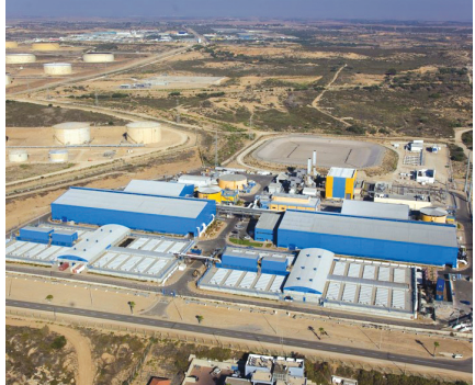
Shanghai Wujing Power Station, China