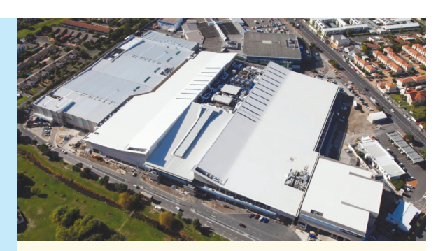
Scheltema Blue Route Mall, Cape Town, South Africa

COLORBOND<sup>®</sup> Ultra steel with base metal thickness of 0.30 mm to 1.30 mm, metallic coating AZ200 (minimum 200g/m<sup>2</sup> coating mass), Grade G550 (minimum yield strength 550MPa) or G300 (minimum yield strength 300 MPa), with especially developed corrosion inhibitive primer for the exterior top coat of Super Durable Polyester paint system. The total paint coating thickness is 40 \mu m, on exterior side - 20 \mu m Super Durable Polyester paint over 5 \mu m primer and on reverse side -10 \mu m polyester paint on over