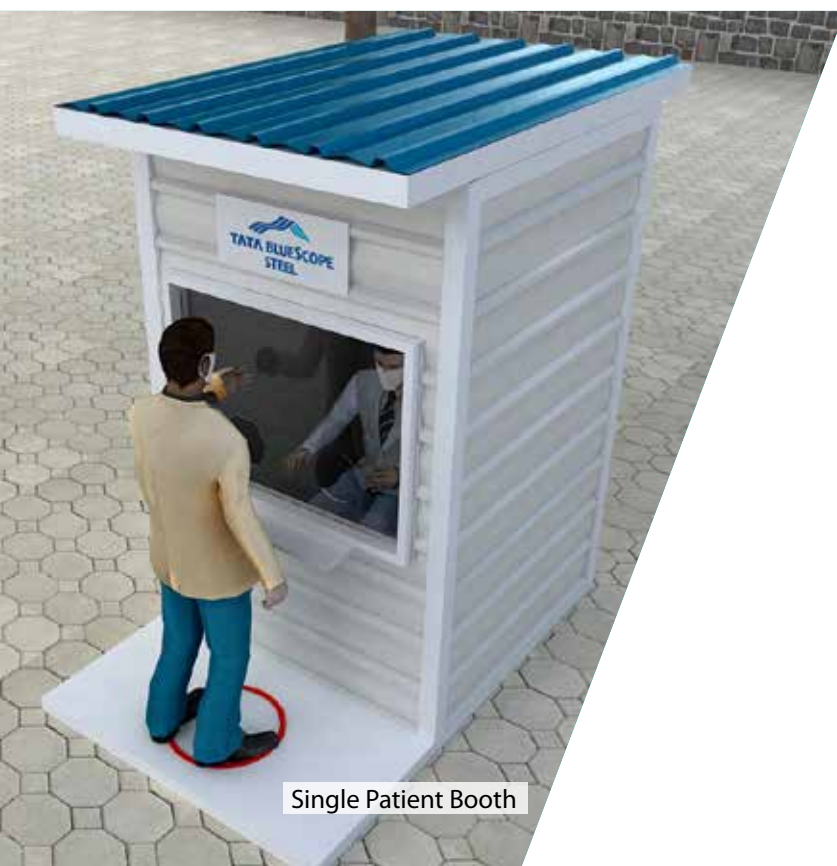
Single Patient Booth