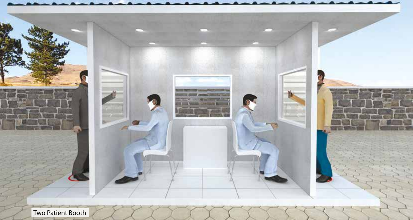
Two Patient Booth

Designed with care, these kiosks ensure highest safety standards for healthcare professionals while collecting & testing samples. Tata BlueScope Steel has developed a contactless chamber built to avoid direct contact with the person. The shielding screen of kiosk cabin protects from aerosols of patients while taking sample. It also minimises the use of PPE for each sample taken.