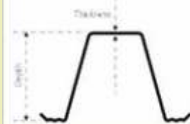
Top Hat Section