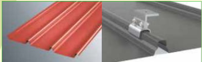
KLIP-LOK® 700 and Solar Mounting Clip