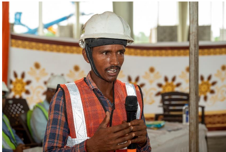
Construction site worker sharing his experience after the Kawach Pro-Certification Workshop