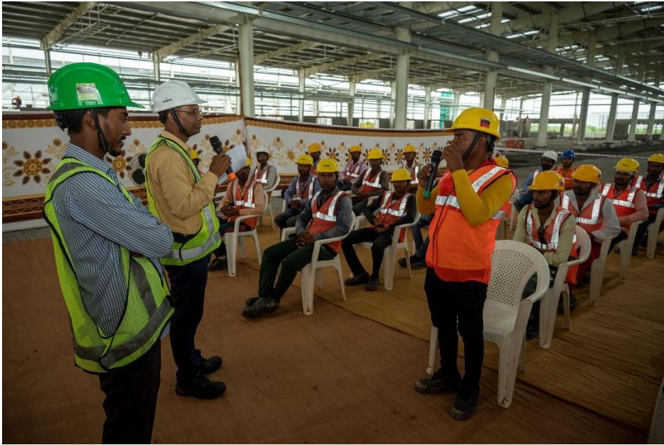
CIDC Trainers in session with site workers