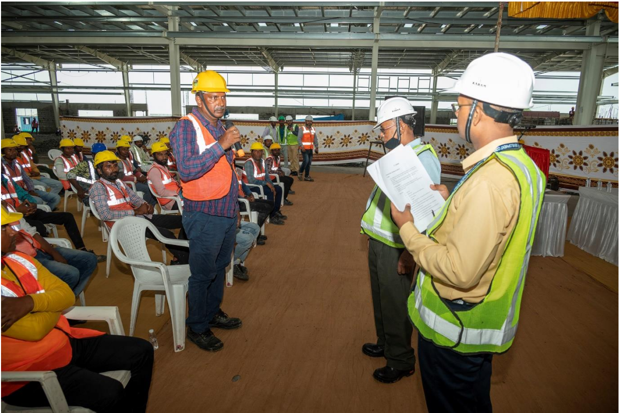
Q&A Session in progress