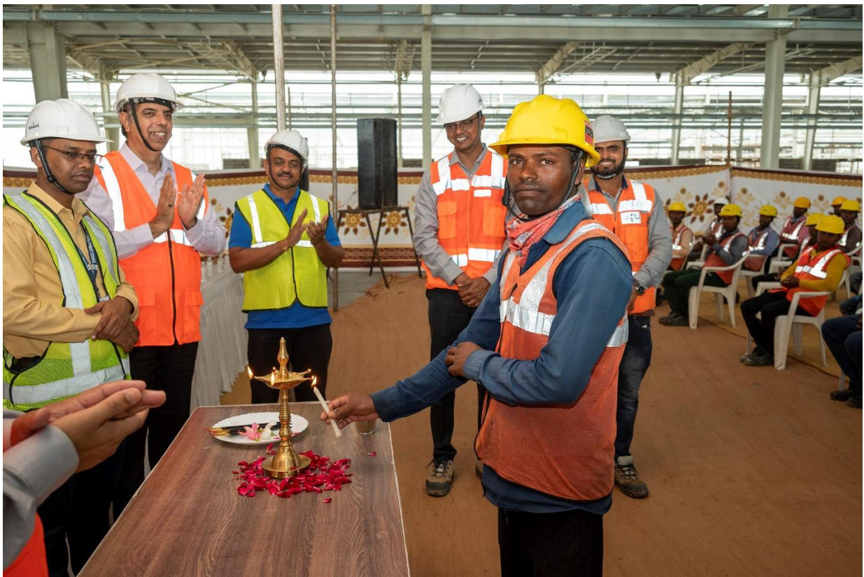
Inaugurating Kawach Pro-Certification Workshop