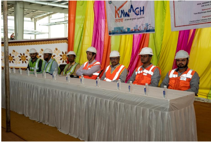
Panel of Industry Experts & Trainers