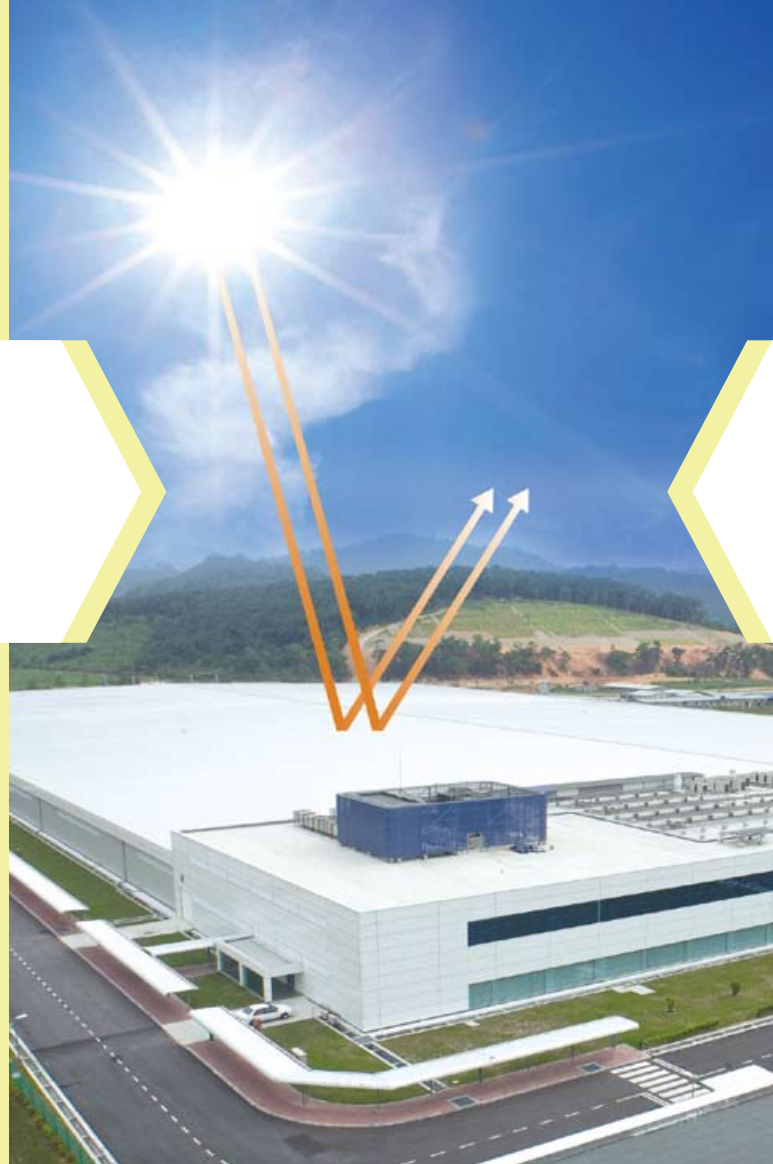
THERMATECH™ Solar Reflectance Technology

Average temperature in the world has increased over the last few years, creating stressful, unhealthy, and unproductive working conditions. It is highly critical